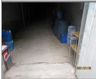
Photo of chemical storage room (if applicable) 3-1 Chemical storage.JPG