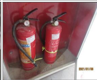
Photo of fire safety equipment 4-1 Fire extinguisher.JPG