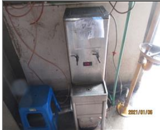
Photo of the sanitary facilities 13-1 Drinking water.JPG