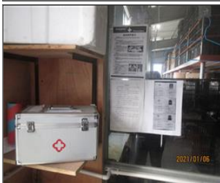
Photo first aid facilities 2-1 First aid kit.JPG