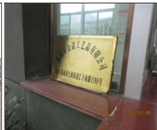
External photo(s) of the production unit(s) 1-3 Factory name.JPG