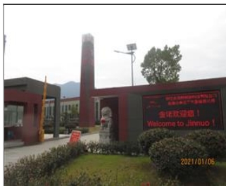
External photo(s) of the production unit(s) 1-1 Factory gate.JPG