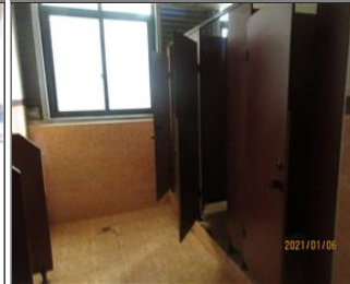
Photo of the sanitary facilities 13-2 Toilet.JPG