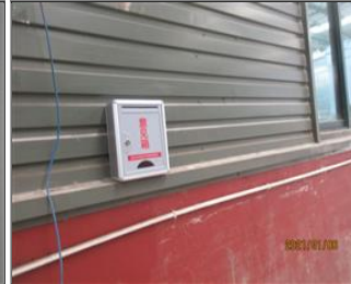
Photo of the inside of the main production hall 9-8 Suggestion box.JPG