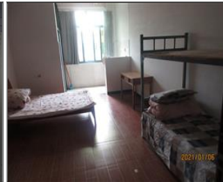
Photo of non-conformity NC - 7.24 No locked cabinet to keep personal belongings was provided for rooms in the dormitory.JPG