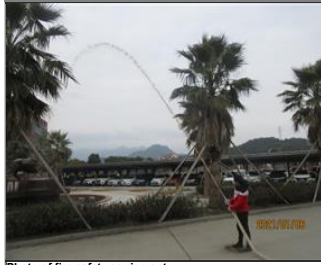
Photo of fire safety equipment 4-5 Test of fire hydrant.JPG