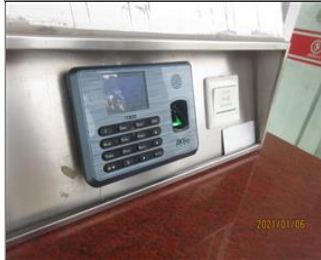
Photo of the inside of the main production hall 9-6 Electronic attendance machine.JPG