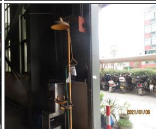
Photo first aid facilities 2-2 Eye washing equipment .JPG