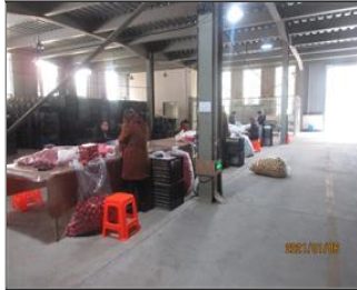
Photo of the inside of the main production hall 9-3 assembly and package.JPG