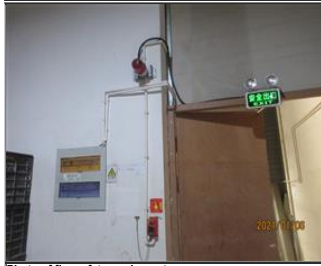
Photo of fire safety equipment 4-2 Fire alarm.JPG