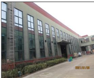
External photo(s) of the production unit(s) 1-2 Factory compound.JPG