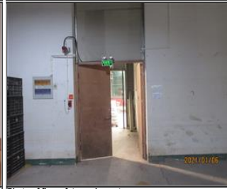
Photo of fire safety equipment 4-4 Emergency lamp and Exit sign.JPG