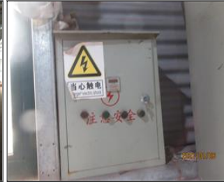
Photo of the inside of the main production hall 9-5 Warning sign.JPG