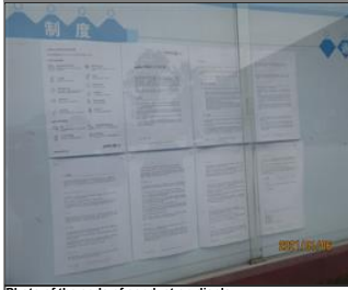
Photo of the code of conduct on display 7-1 Photo of amfori BSCI COC on Display.JPG