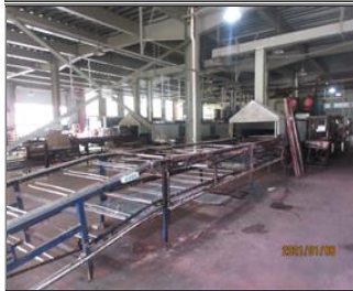
External photo(s) of the production unit(s) 1-4 some production lines were not running due to the audit was conducted in slack season.JPG