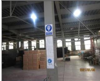
Photo of the personal protection equipments (if applicable) 11-1 PPE reminder .JPG