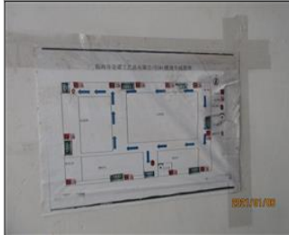
Photo of the inside of the main production hall 9-7 Evacuation plan.JPG