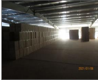
Photo of the inside of the main production hall 9-4 warehouse.JPG