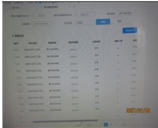
Photo of non-conformity NC - 5.5 Not all workers were provided with social insurance.JPG