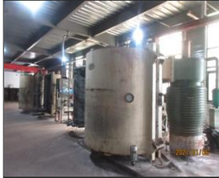
Photo of the inside of the main production hall 9-1 painting and vacuum coating.JPG