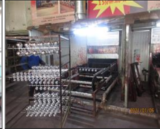
Photo of the inside of the main production hall 9-2 dyeing.JPG