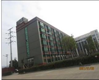
Photo of the dormitories (if applicable) 8-2 dormitory building.JPG