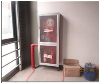
Photo of fire safety equipment 4-3 Fire hydrant.JPG